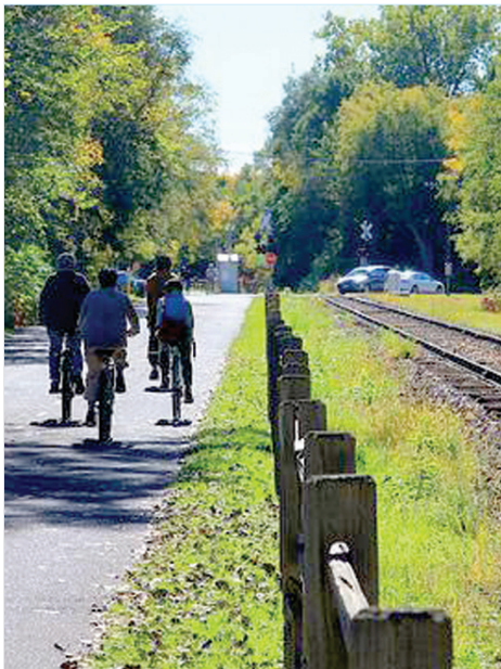
Rail with trail in Sonoma County

The appeal demanded an expensive and time-consuming Environmental Impact Report (EIR) on a small section of Segment 7. However, city staff and biologists presented evidence that the environmental impact was "not