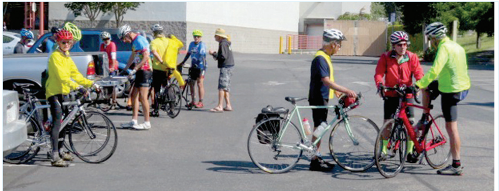
The June 18th Tuesday Ride from Gateway shows some riders remaining out of the lane for cars, while other riders socialized in an area dangerously close to passing vehicles.

We need to be thankful to be given the right to stay parked there for hours at a time. We need to be mindful of the fact that these parking lots are also used by other people, usually motorists and pedestrians who are trying to get in and out of the lot as they do their errands.