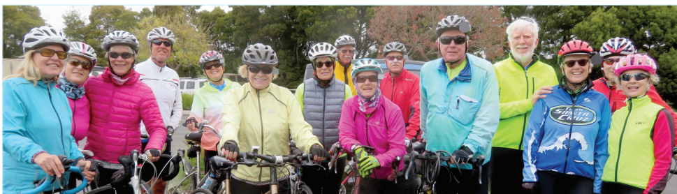
Tuesday C riders gather on a cool Tuesday morning at West Marine Parking Lot in Watsonville for weekly ride.